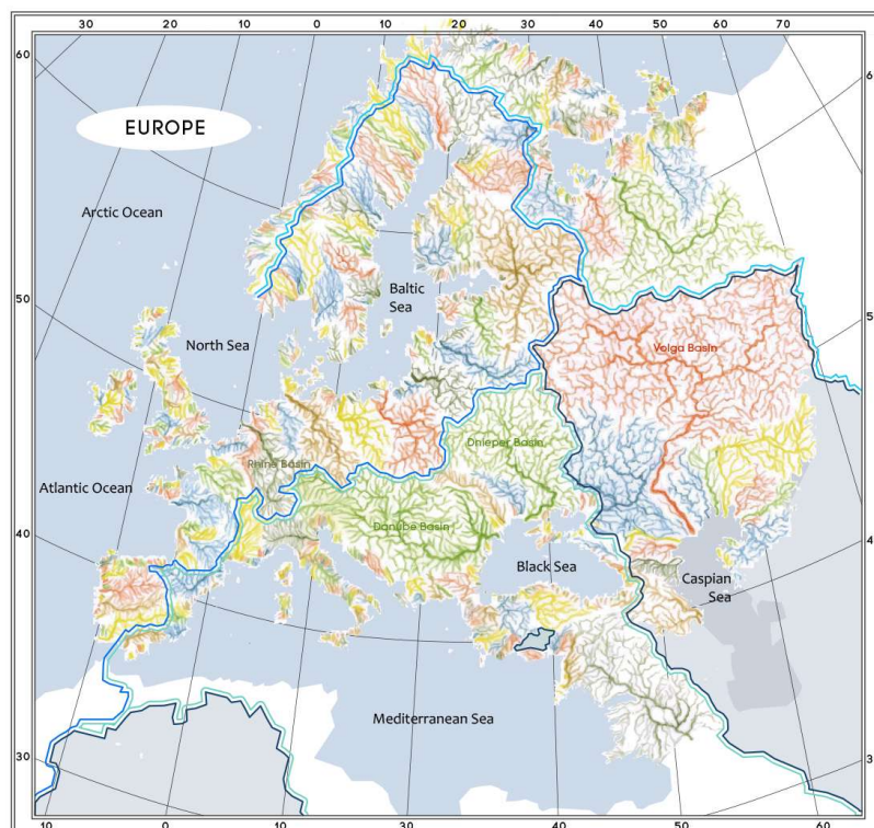
'Eco-social regions. An Illustration from a children's geographical encyclopedia, Odyssea

What is friendship? It is a relation where that is beneficial for those involved, and at the very least harmful to no one.